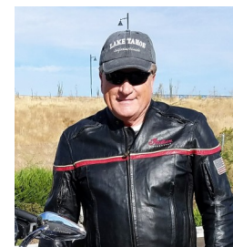
Gene Walker Photographer